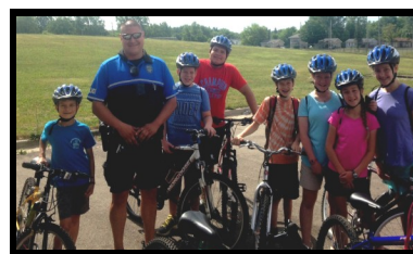
Bike campers at Hawk Island on “ride”